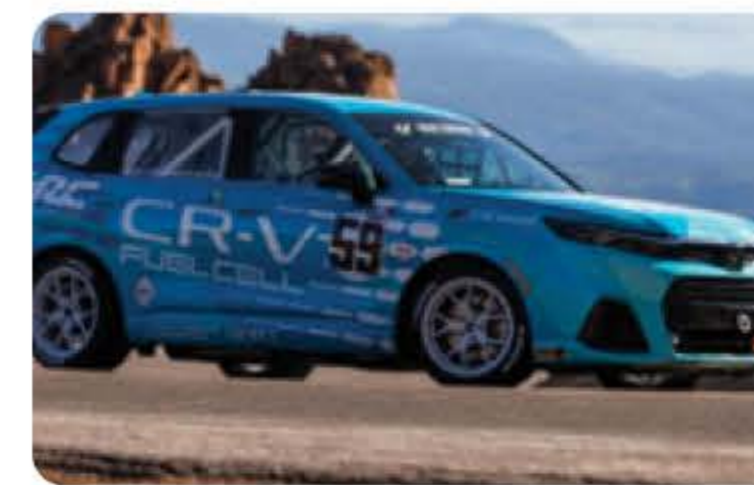
Yoshihara + HRC break new ground at Pikes Peak in 2025 with Hydrogen-fueled EV