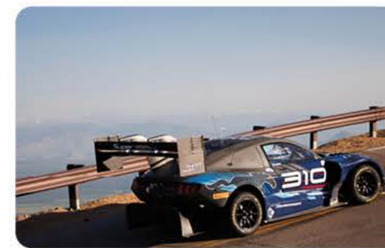
Pikes Peak Hill Climb Highlights presented by Ford Performance